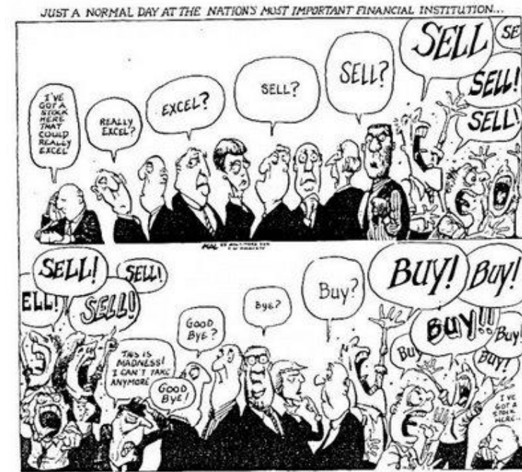
International Herald Tribune, October 27, 1989. Kal, Cartoonists and Writers Syndicate, 1989.